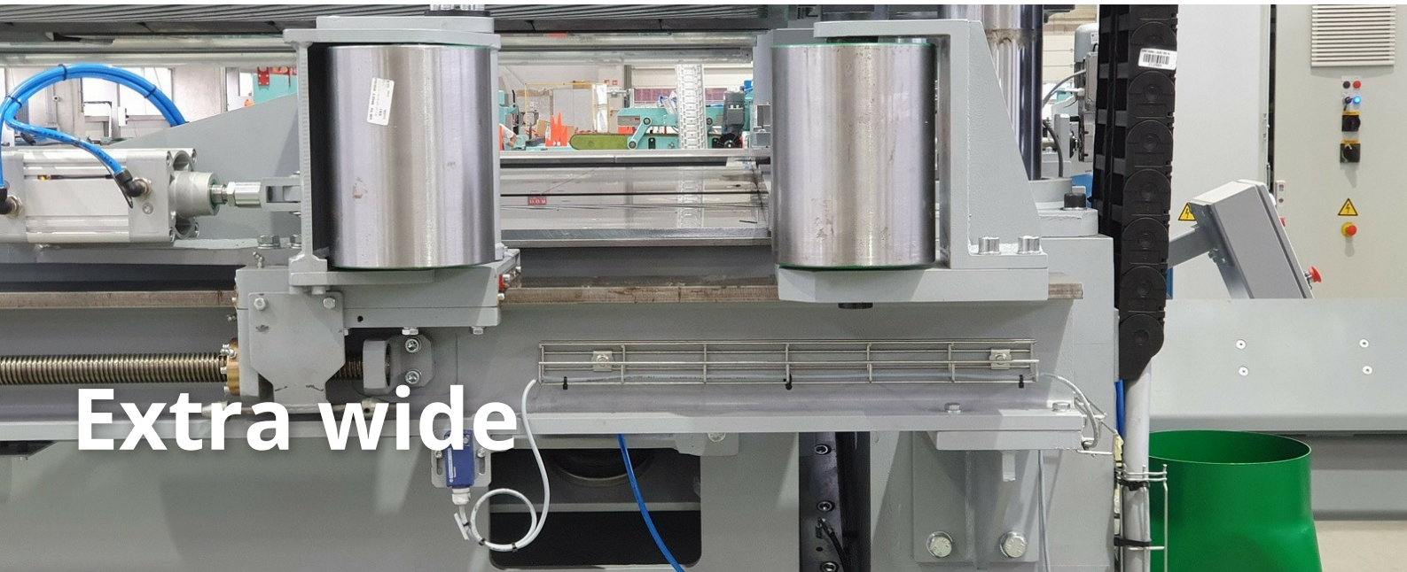
LEDINEK - PLANING PROFILING - SUPERLES 3000